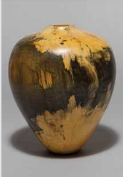
Here is the simplest setup: overhead light comes from a single compact fluorescent photo bulb mounted in a socket with a reflector but no diffuser. The lighting is flat with no sense of depth, and the shadow is strong.

run for a long time at low temperatures, and have a lifespan of a few thousand hours. At $8 to $10 each, they are more expensive than the lamps available in home centers, but their quality is worth it. In the setups shown in this story, I'm using a single 43-watt bulb in a small ball-head fixture attached to a lightweight aluminum stand. My hardware is ancient, but you can buy similar gear for $20 or less. When I need more light, I add a 27-watt bulb as a fill light.