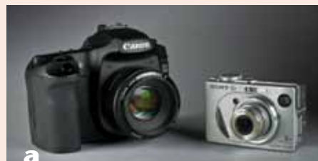
Two kinds of digital camera The digital single-lens reflex (DSLR) camera on the left has interchangeable lenses, a large sensor, and many manual settings. The compact camera on the right may be all you need because it has a manual mode that gives you control over the exposure.

Most DSLR sensors are sized like 35mm film, with a 3:2 width-to-height ratio. Compact cameras primarily use a 4:3 ratio. This makes a difference when you want a specific enlargement such as an 8" by 10" print (4:5 ratio): You'll have to crop the image to achieve it.