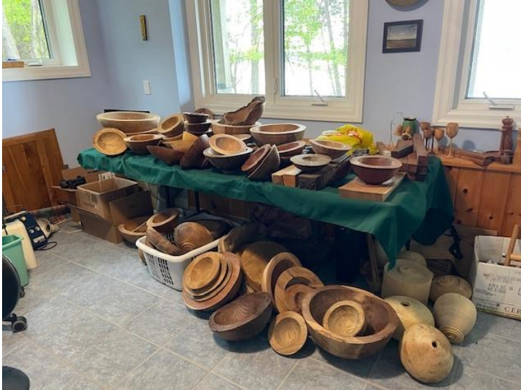
Selection of rough turned bowls 6" – 17". Variety of wood types