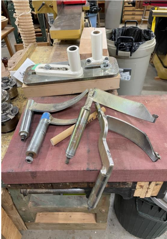
OneWay bowl saver with two cutter sets and platform for lathe bed - $450.00