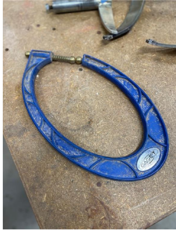
Tompkins Gauge for measuring bowl thickness - $60.00